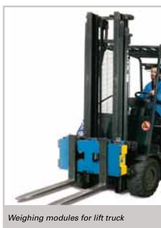
Weighing modules for lift truck

The range of Dini Argeo products includes also: