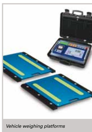
Vehicle weighing platforms