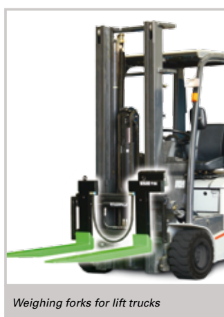
Weighing forks for lift trucks