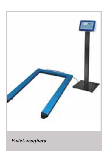
Visit our web site www.diniargeo.com for: